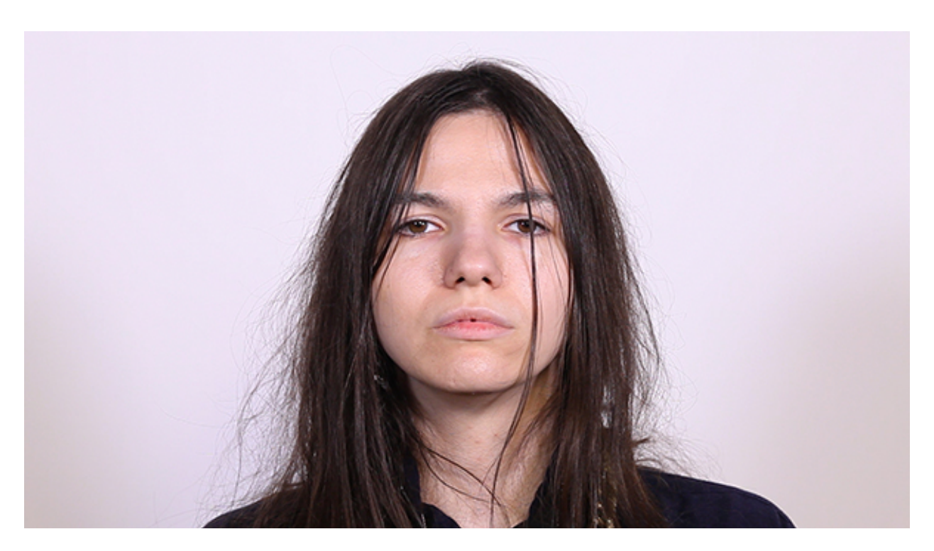
untitled, 2012, still from 4 channel video installation, 47 Canal