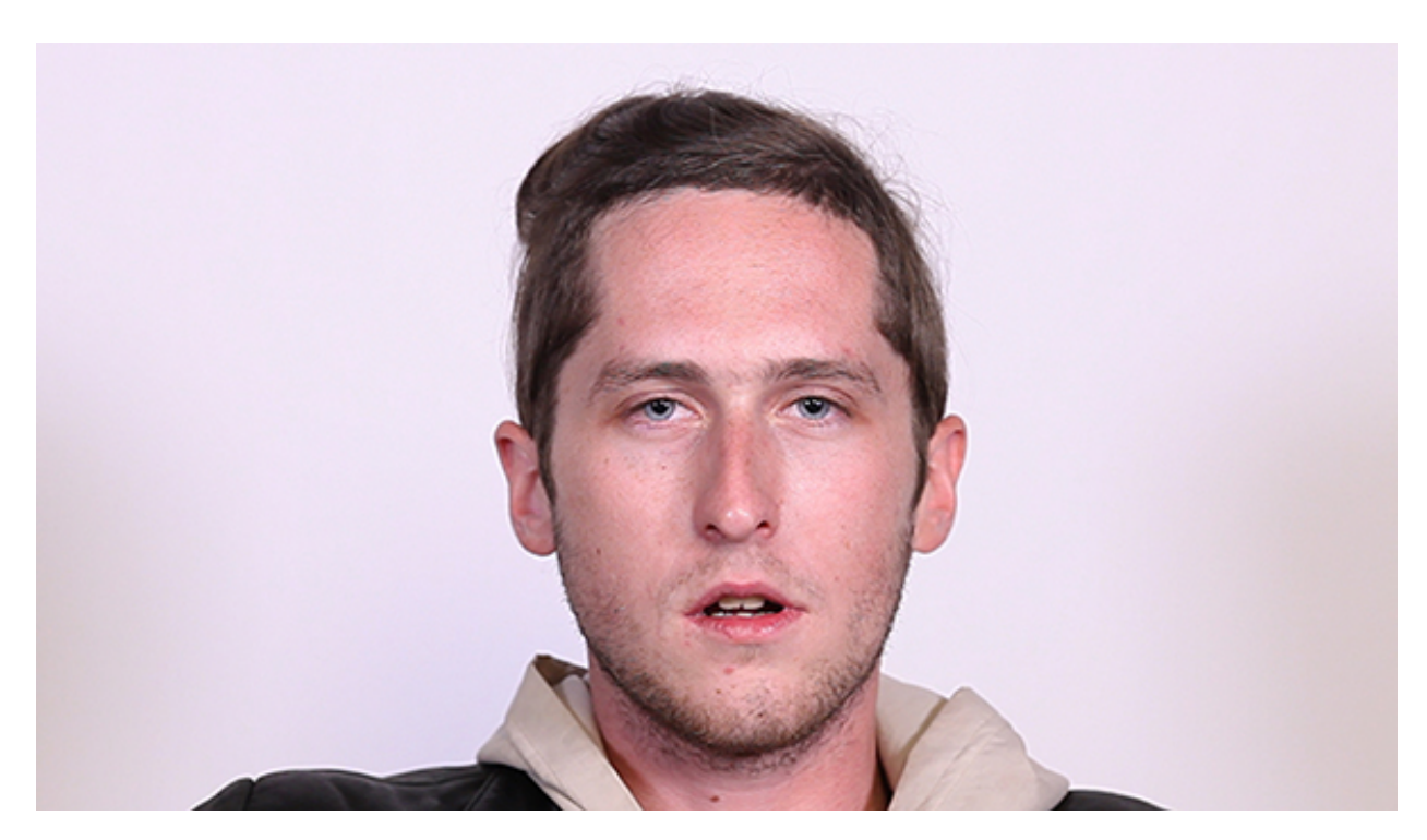
untitled, 2012, still from 4 channel video installation, 47 Canal