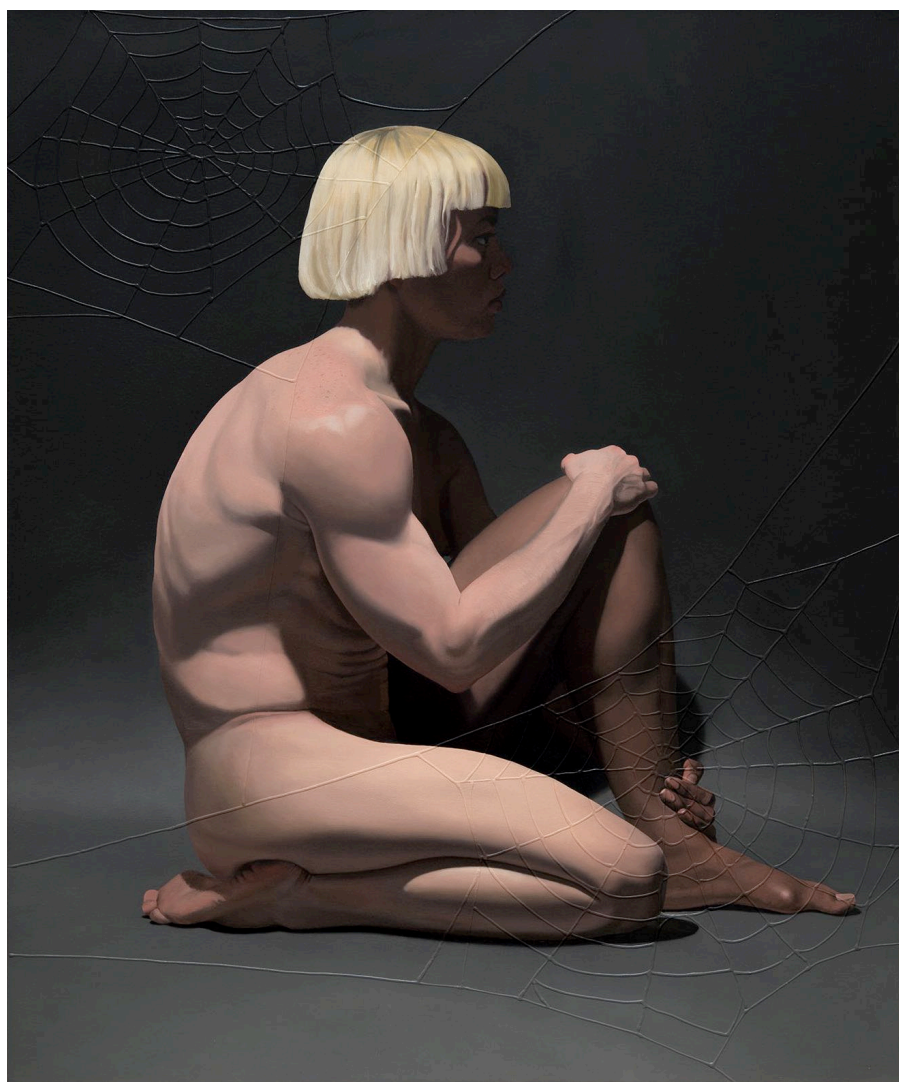
Next page: Nolan Simon Orange Slice Painting or My Face When you dig down one more layer and it's all about a deeper sort of antagonistic respect for people (2013) Courtesy of the Artist; 47 Canal, New York; and Lars Friedrich, Berlin Photography by Simon Vogel