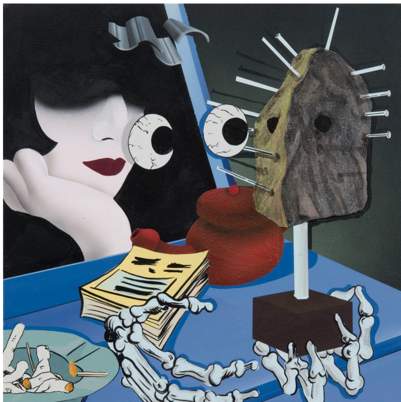
This page, above: Jamian Juliano-Villani Mixed Up Moods (2014)