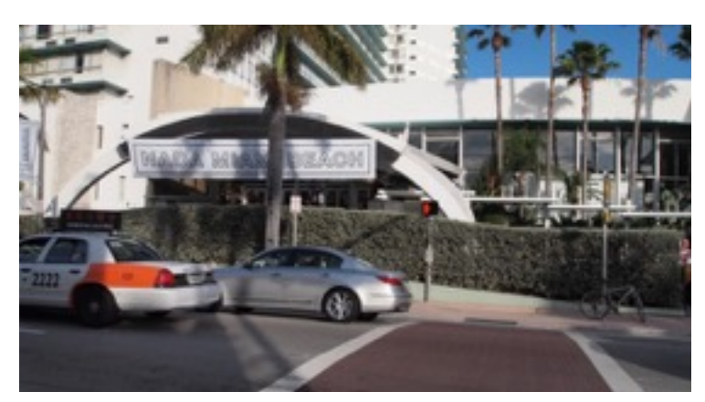
Do you sometimes wonder what the outside of NADA looks like? Wonder no more.

by WILL BRAND AND PADDY JOHNSON on DECEMBER 7, 2012 · ART FAIR