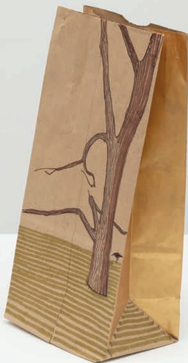
Orenda (AaTmn!) , 2012, colored pencil, marker, and acrylic on paper bag, 12 × 6 × 4 in.