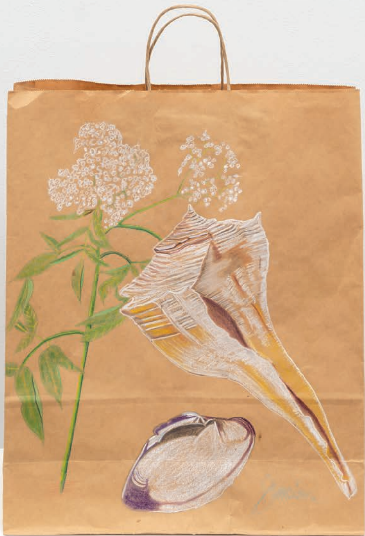
Decolonize , 2012, colored pencil, collage, oil pastel, and gold foil on paper bag, 23 × 15 ½ × 5 in.