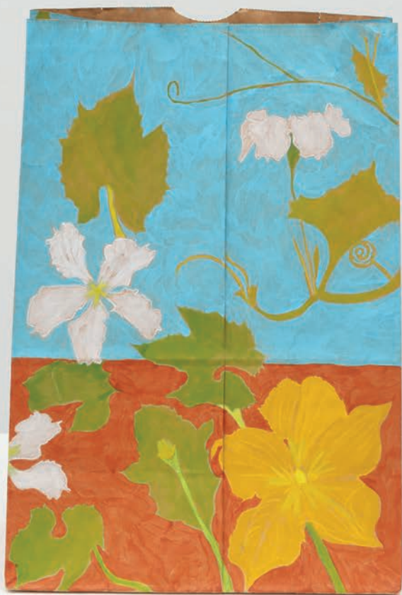
Gourd Dancer , 1999, acrylic on paper bag, 17 × 11½ × 7 in.