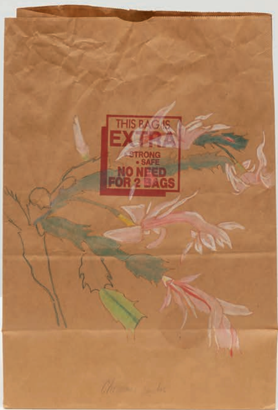
Christmas Cactus , 2001, colored pencil and china marker on Aunt Millie's bag, 16½ × 11½ × 7 in.