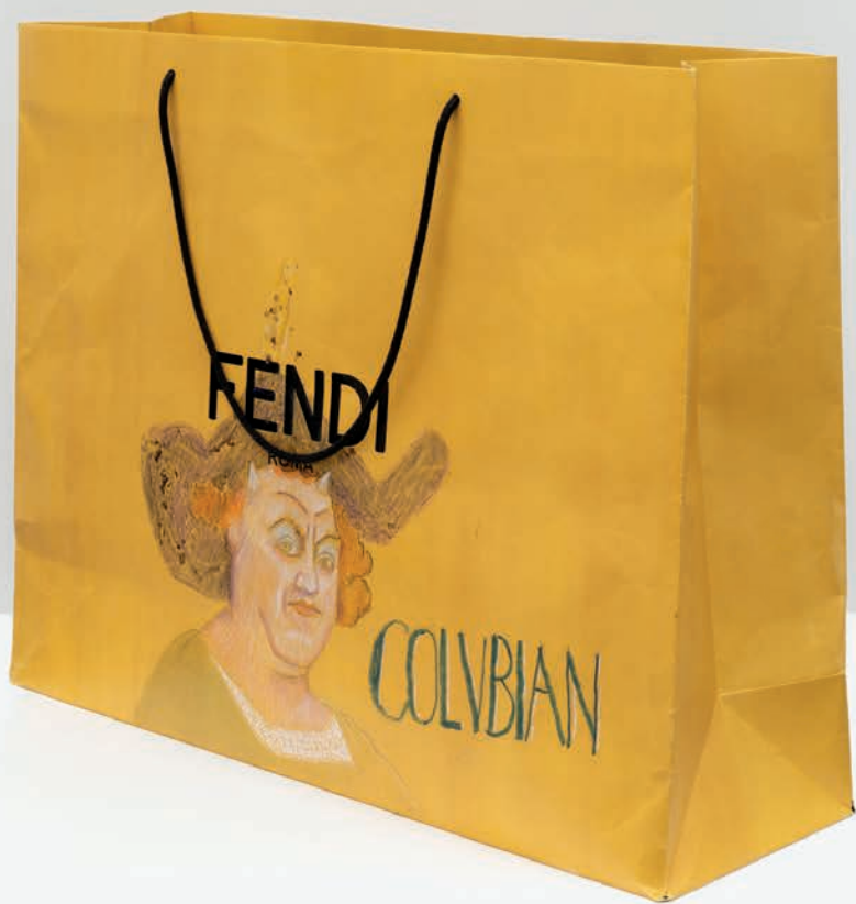
Revoke Papal Bulls , 2022, blackberry juice, plastic beads, leather, thread, safety pin, foil, colored pencil, and acrylic on Fendi bag, 19 ½ × 24 ¼ × 8 in.