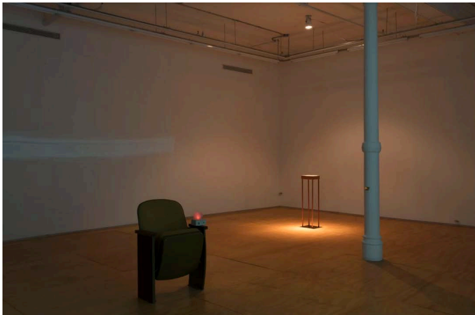
From "Mosquitoes, Dusts and Thieves,"