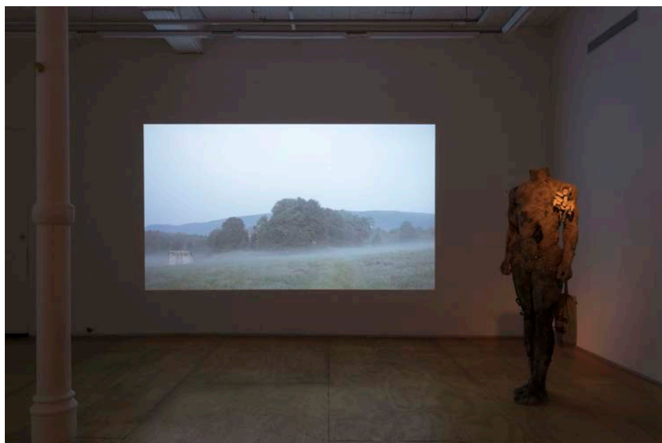
From "Mosquitoes, Dusts and Thieves," Courtesy of 47 Canal