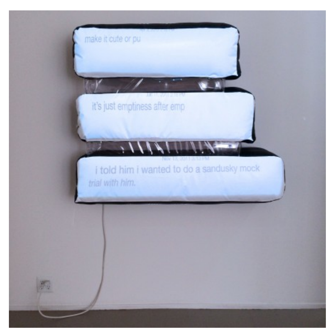
Anicka Yi, Somewhere Between I Want It and I Got it (2014)

The works at Anicka Yi's Divorce , which was on view at 47 Canal until Sunday June 8th, felt like something of a series of scenarios: moments of banal chores, sexual trysts and social interaction that work together to create a sense of disjointed narrative. Incorporating many of the art world's currently popular tropes, particularly household materials and industrial approaches to display and mounting, Yi turned her objects towards a particularly personal subject: that of divorce.