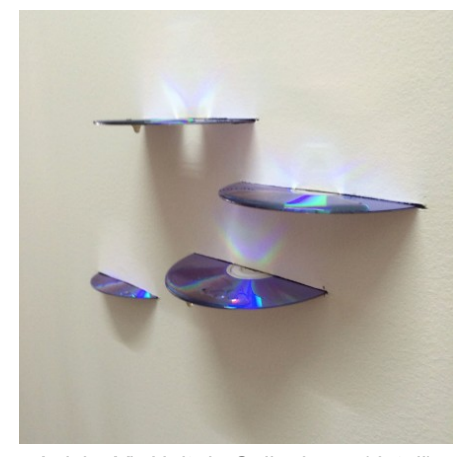
Anicka Yi, Nuit de Cellophane (detail) (2014)