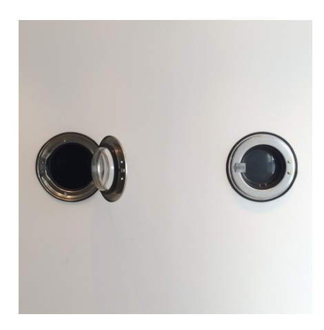
Anicka Yi, Washing Away of Wrongs (2014), via Kelly Lee for Art Observed

Pulling from a disparate set of techniques, approaches and materials, Yi's works included a wall of embedded DVD's coated in a thick, dripping layer of honey, a series of cardboard and plexiglass boxes filled with snails, an inflatable set of screens displaying comical messages and personal rants, and a pair of washing machine doors, opening into black tunnels where viewers can inhale a set of sickly, pungent odors.