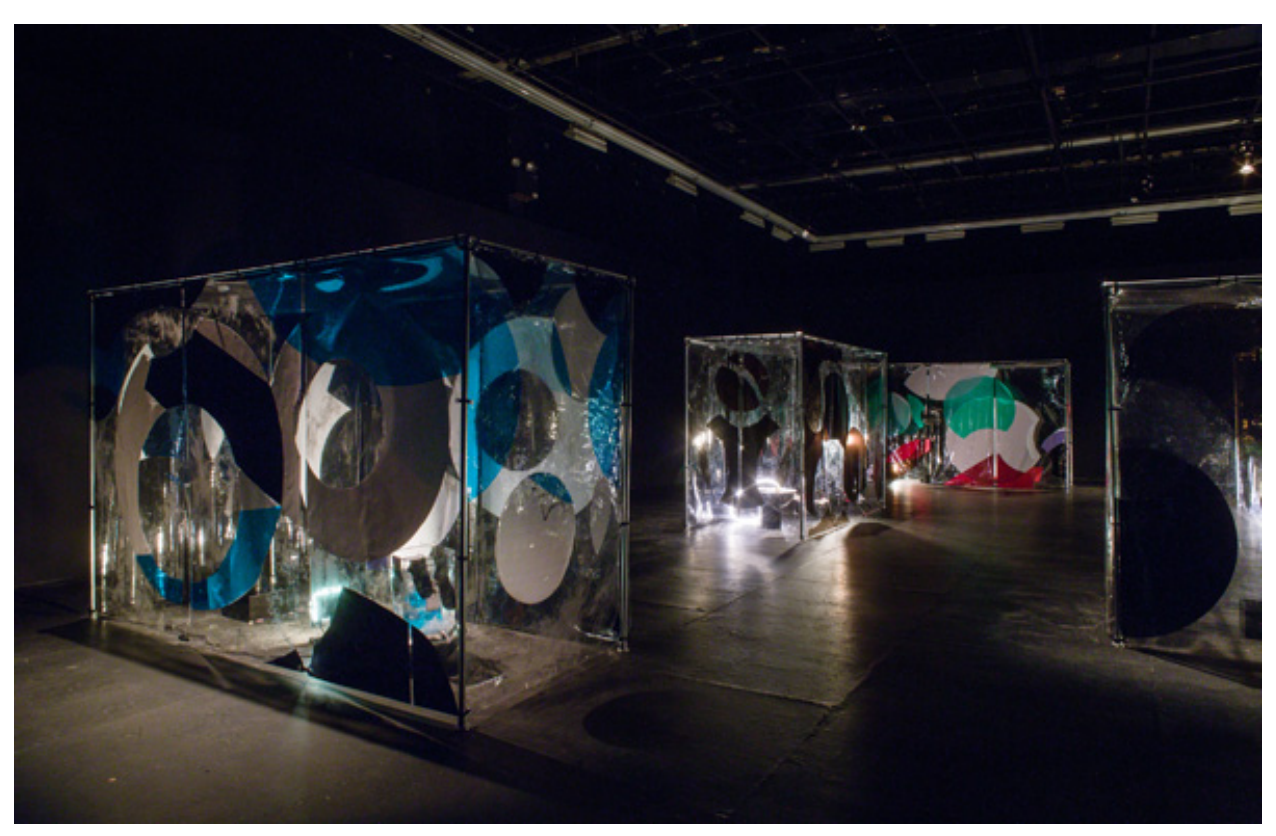
Anicka Yi. You Can Call Me F, 2015; installation view, The Kitchen, New York City.

The fragile biological ecosystems inside the tents are a fusion of organic and inorganic materials. A spaghetti of fabric and plastic jewels spills out of a stainless-steel cauldron, a crude circle of tar lines the floor, inscrutable motorcycle helmets slowly pivot atop poles. In one tent, a series of hides are hung out as if to dry; in another, an orb covered in what might be skin shavings or garlic cloves teeters precariously on a table's edge. The viewer is awarded glimpses of these strange arrangements, but the implied limit of the tent's quarantine precludes a full comprehension. Visitors are reminded of the dangerous, slippery category of female . Yi's installation cultivates such anxieties surrounding the classification of the term and the linguistic terrorism that exists between gender, sex, and subjectivity.