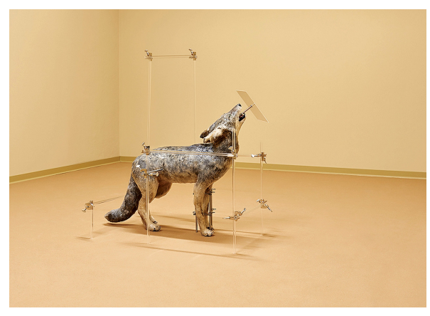
"Search Image," 2016, with a taxidermy coyote and hardware.