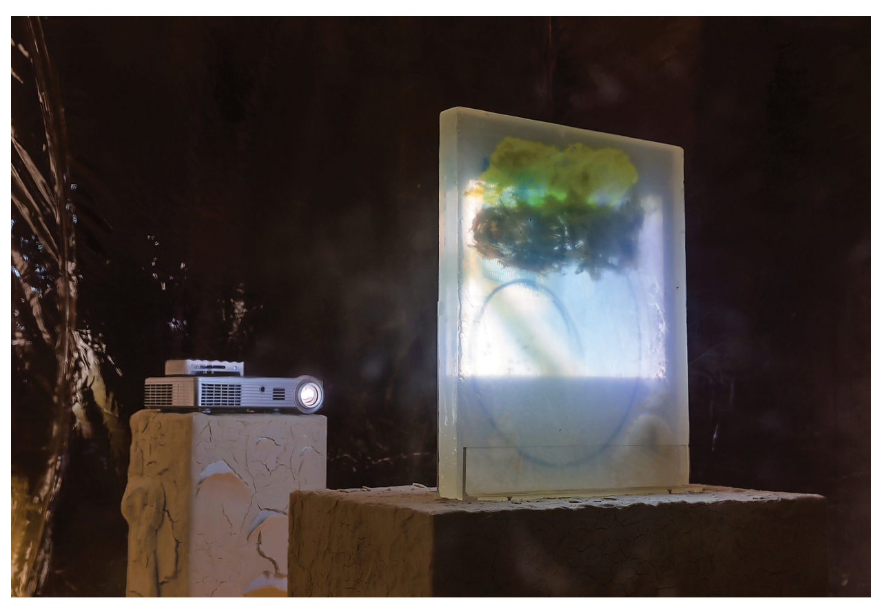
"Le Pain Symbiotique," 2014, with materials ranging from glycerin soap to dough.

centered on "the scent of forgetting," a fragrance Yi created in collaboration with a French perfumer and whose design began by imagining the perspective of a fetus in an amniotic sac. The accompanying catalog — a reprinting of Yi's first monograph — was produced on incense paper infused with the scent. Visitors were encouraged to buy the book and then burn it after reading.