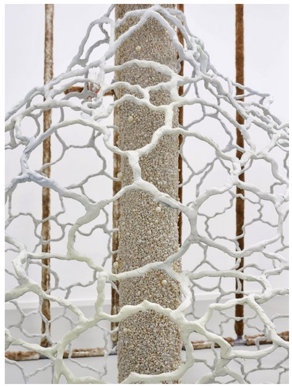
"When Species Meet Part 1 (Shine or Go Crazy)," 2016, features, among other things, faux fur, lab hardware and imitation pearls.

We met four months before the opening of her Guggenheim exhibition, and she was reluctant to talk about what would be in it. It was clear that her hesitation wasn't so much a performance of privacy or even a commitment to surprise as it was a genuine sense of unknowing. Whatever she told me would almost certainly be untrue within a week or two. She would likely be as surprised by the final work as I would be.