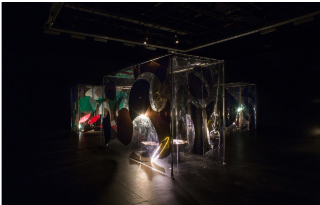
Anicka Yi, You Can Call Me F installation view, 2015

"You Can Call Me F" will be on view at the Kitchen until April 11, 2015.