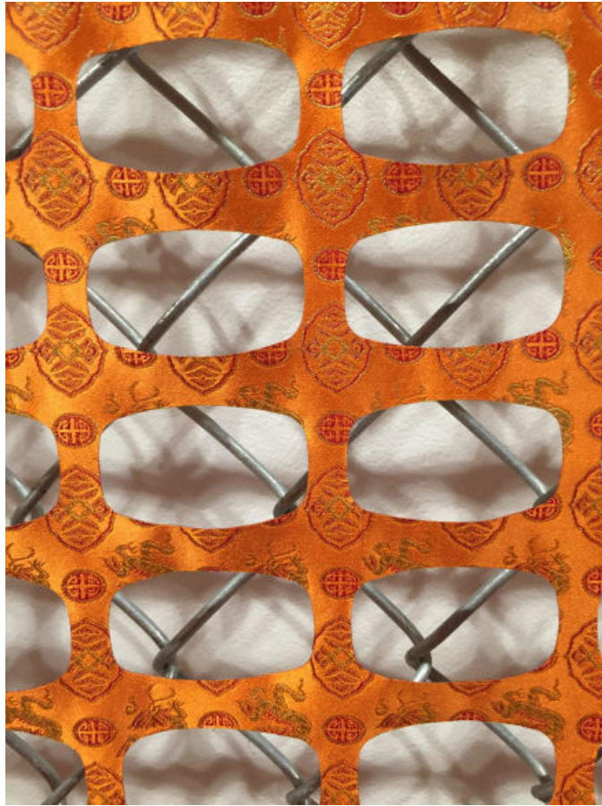
Amy Yao, Foreign Investments (detail) (Good Ramen) (2017).

For starters, 47 Canal is in a different space than when Yao's first exhibition, Skeletons on a Bender was presented with the gallery. Not only has the location changed, but so has Chinatown, where all of 47 Canal's various spaces have been. Like every gentrifying neighborhood in New York, there is an influx of new businesses and new places to live. Weeds... focuses on this changing landscape and, specifically, on the idea of "authenticity."