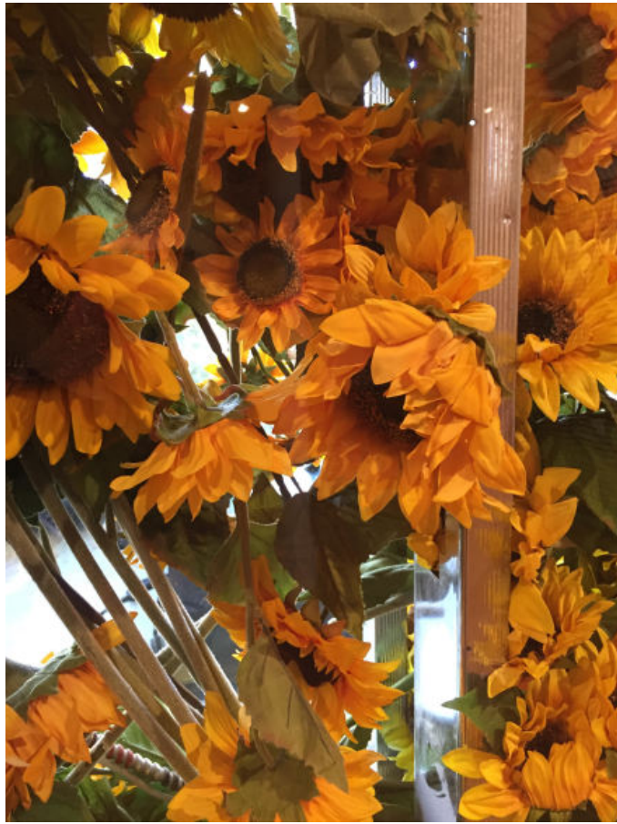
Amy Yao, Revolution Within (detail) (2017), via Art Observed

Throughout the gallery, Yao has erected chain-link fences that are covered in yellow and orange construction sheathing, a familiar site in the neighborhood. However, while mimicking the color and cut of construction coverings, Yao's fences use silk fabric adorned with Asian floral patterns instead of plastic. This material refers to the allure of the idea of authenticity when introducing new elements to an existing area. The builders are hoping to construct something to that capitalizes on the already-in-place atmosphere of the site, while not necessarily bearing any connection to that location. While one of these fences is free-standing in the gallery—in fact it actually blocks the gallery entrance so that one has to walk around it to see the exhibition—the other two are built right up against the existing walls. The holes in the construction coverings are meant to offer a peek.