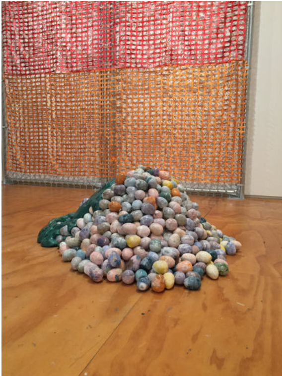
Amy Yao, Weeds of Indifference(2017), via Art Observed

On the floor of the gallery are two piles of Easter eggs, made of some sort of hardened slime. Again, a material bait and switch takes place here: the eggs are actually cast from plastic Easter eggs, using their hollow interior as a mold to create these new, plastic eggs. These smaller sculptural works also recall Yao's last show at Various Small Fires, Bay of Smokes, and its suspicion of "the kind of ill advised self-production, unavoidably occurring in biological bodies at sites of material transformation," adds a striking element to the exchange with broader political engagement with the neighborhood around the gallery. Between the floor sculptures and the fences is a conversation happening about the "natural" and the "authentic" and the plasticity that both these terms have taken on these days in consumer culture.