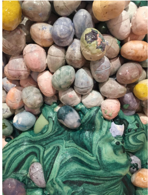
Amy Yao, Weeds of Indifference (detail) (2017).

Weeds of Indifference, as well as recent exhibitions by Michele Abeles and Josh Kline, is a solid reminder of why 47 Canal caught on in the first place and why they continue to lead the dialogue on modern sculpture. Yet the show's subject matter, and its interest in the landscape of Chinatown itself, underscores that even while some are interested in exploring the social problems inherent in modern capitalism, one is often turned into an antagonizing force at the same time.