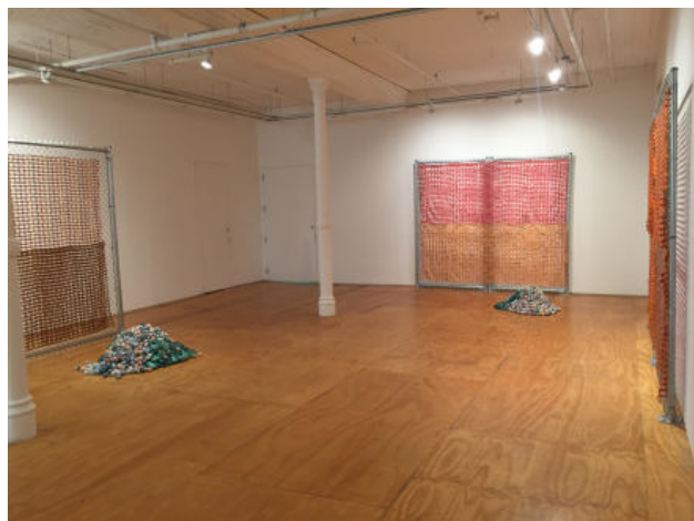
Amy Yao, Weeds of Indifference (Installation View)

Throughout the gallery, Yao has erected chain-link fences that are covered in yellow and orange construction sheathing, a familiar site in the neighborhood. However, while mimicking the color and cut of construction coverings, Yao's fences use silk fabric adorned with Asian floral patterns instead of plastic. This material refers to the allure of the idea of authenticity when introducing new elements to an existing area. The builders are hoping to construct something to that capitalizes on the already-in-place atmosphere of the site, while not necessarily bearing any connection to that location. While one of these fences is free-standing in the gallery—in fact it actually blocks the gallery entrance so that one has to walk around it to see the exhibition—the other two are built right up against the existing walls. The holes in the construction coverings are meant to offer a peek.