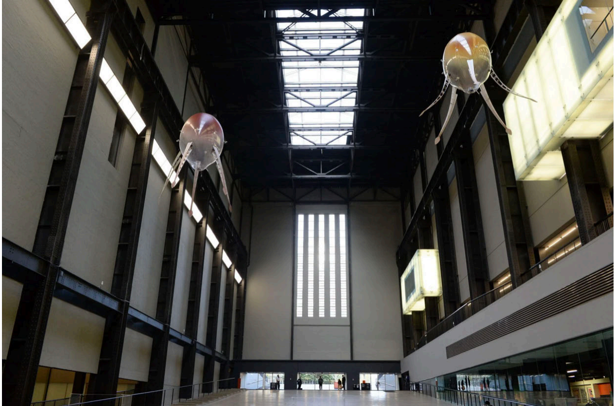
Anicka Yi's 2021 exhibition at Tate Modern in London.

like, feral in a way,” she said of her approach to the art field. “I’m one of the Lost Boys, right? Peter Pan and the Lost Boys. We’re just in our thing, and la-la-la, and all of a sudden, the adults are around.”