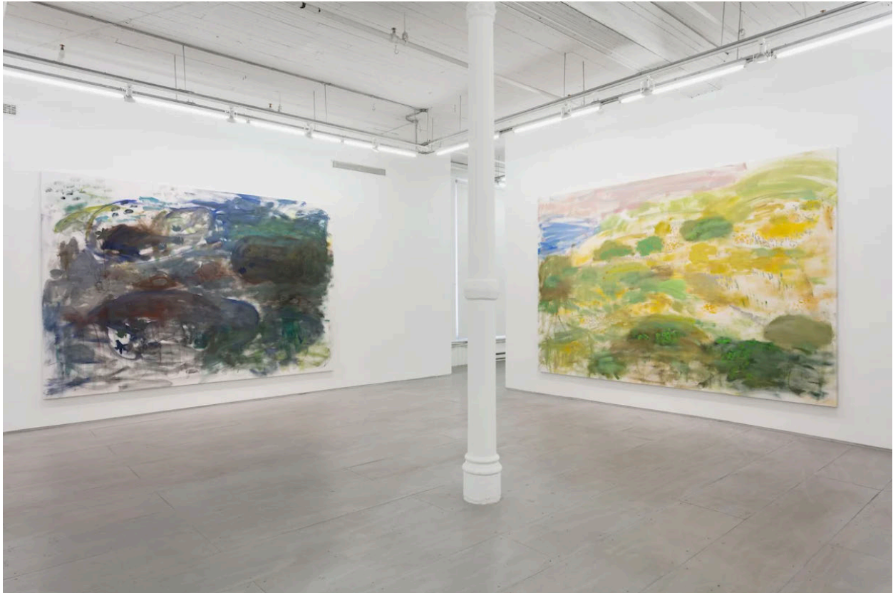
An installation view of Trevor Shimizu's 2020 exhibition at 47 Canal, “Landscapes.”

she signed off, “I looked at the staff,” she told me, “and I said: Bring it!”