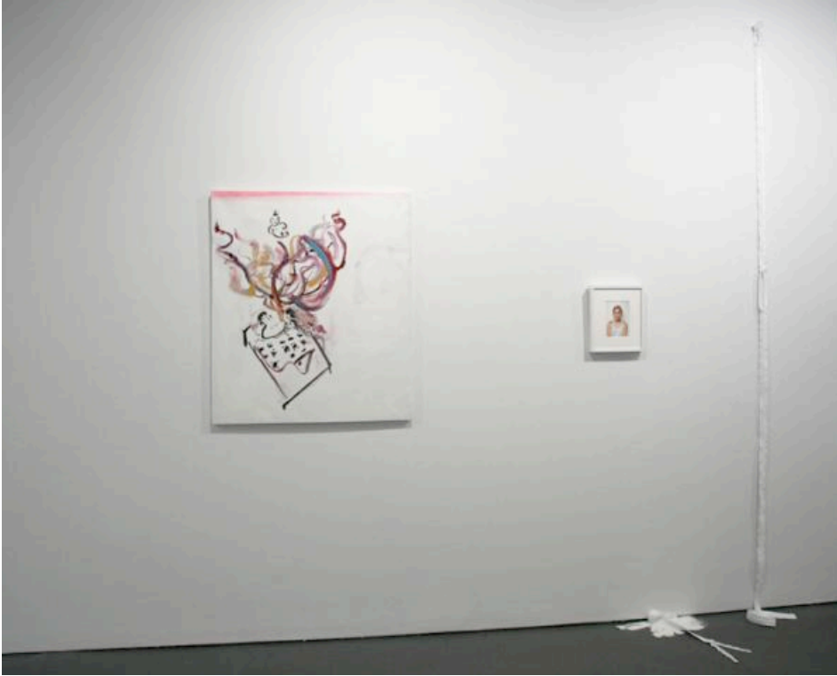
179 Canal/Anyways, installation view.