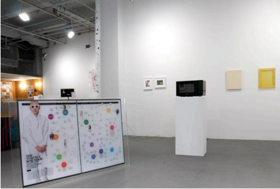
179 Canal/Anyways, installation view. Via 179 Canal

Crucially to its success, the show raises the question: did 179 Canal have to close in order for this White Columns' show to happen? Does everything that enters this particular space have to die a little death before it's acceptable? I would have liked to see this show while the original space existed concurrently. The intro could have read, "the space (179 Canal) is currently there and then project (179 Canal) is here..." Maybe then some works wouldn't have felt like they had cleaned up their act quite so much.