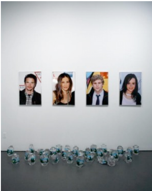
179 Canal/Anyways, installation view. Via 179 Canal

In April I had seen the work of Anicka Yi on Canal Street, an intense combination of inflatables, Glade plug-ins, hair gel, rice flour and other ingredients that felt not only raw but alive. At White Columns, canvas textured soap cast around stretcher bars felt like nothing more than an unnecessary and played out commentary on painting. They were soap infused with something but looked simply like resin; it felt like different work by a different artist with a totally different set of concerns.