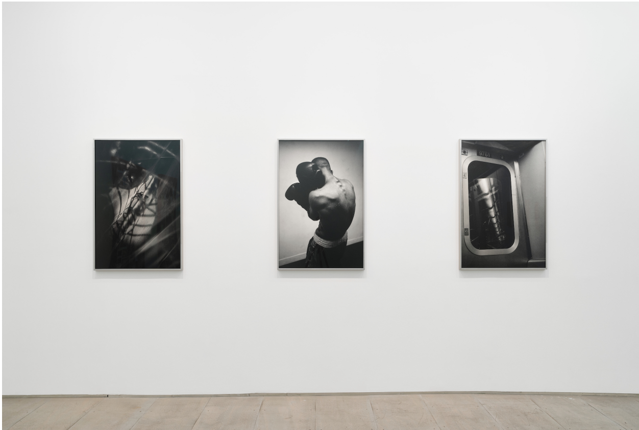
Installation View: Elle Pérez: guabancex , 47 Canal, New York, 2023.