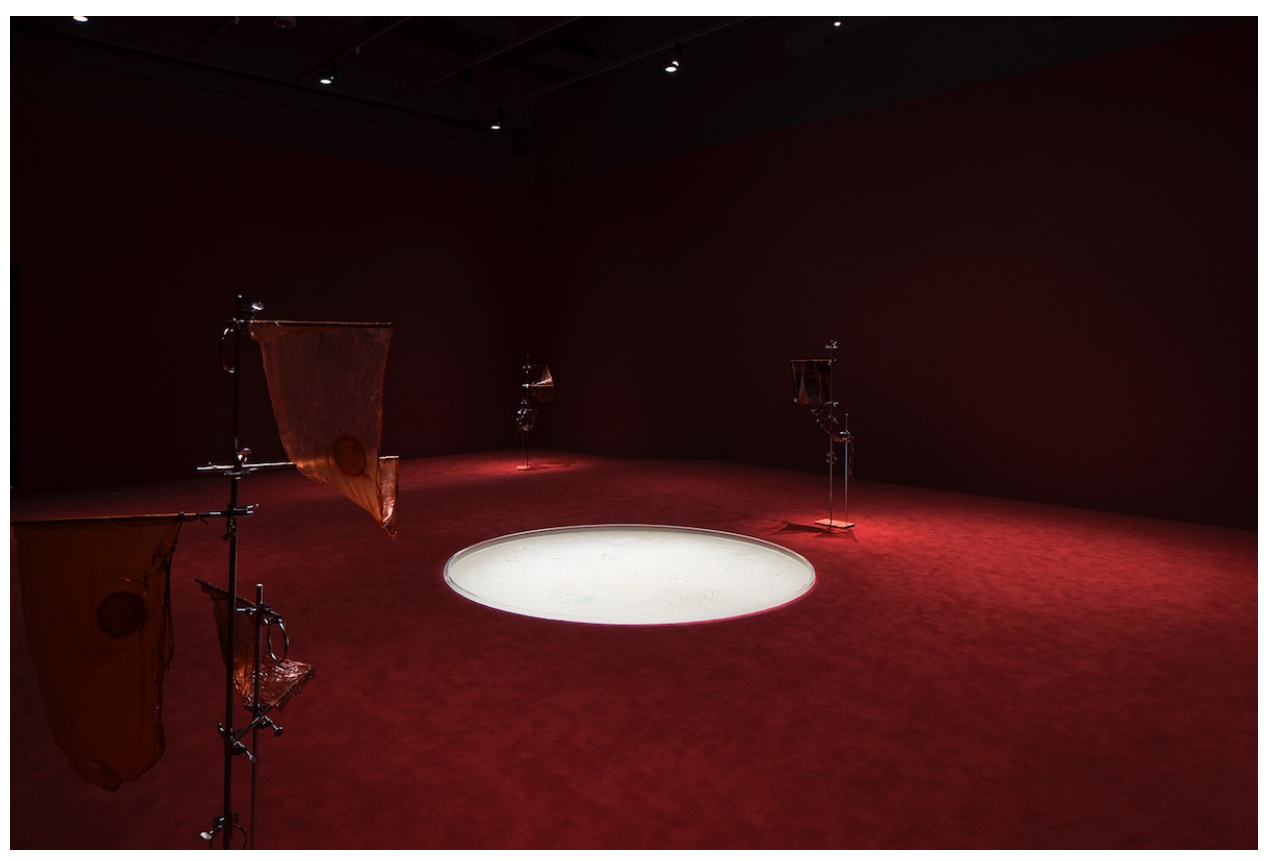
Installation view: Anicka Yi, "6,070,430K of Digital Spit," MIT List Visual Arts Center, Cambridge, MA.