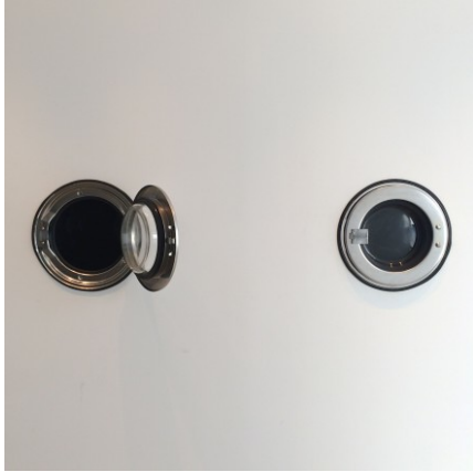
Anicka Yi, Washing Away of Wrongs (2014), via Kelly Lee for Art Observed

Pulling from a disparate set of techniques, approaches and materials, Yi's works included a wall of embedded DVD's coated in a thick, dripping layer of honey, a series of cardboard and plexiglass boxes filled with snails, an inflatable set of screens displaying comical messages and personal rants, and a pair of washing machine doors, opening into black tunnels where viewers can inhale a set of sickly, pungent odors.