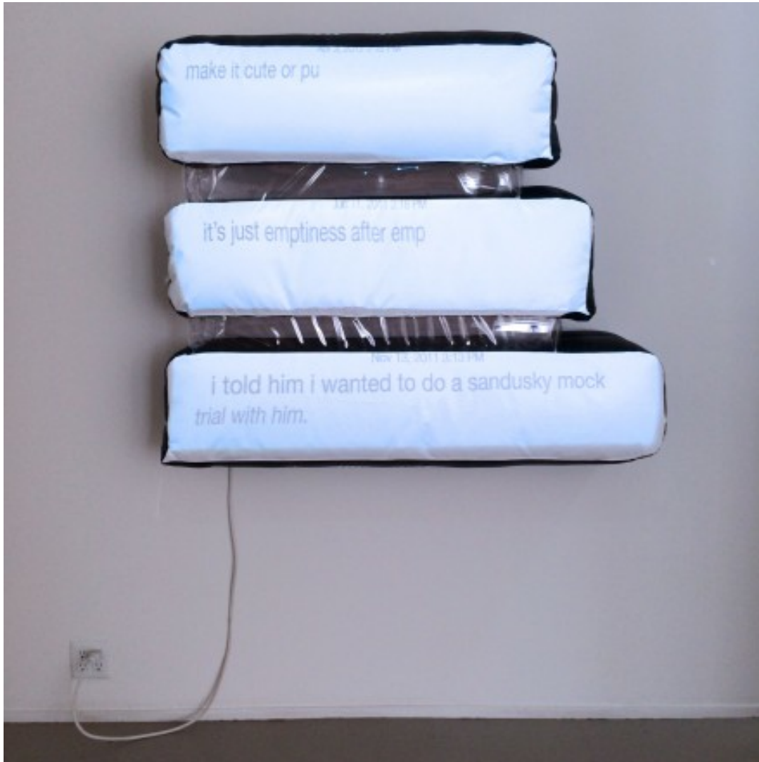
Anicka Yi, Somewhere Between I Want It and I Got it (2014), via 47 Canal

The works at Anicka Yi's Divorce , which was on view at 47 Canal until Sunday June 8th, felt like something of a series of scenarios: moments of banal chores, sexual trysts and social interaction that work together to create a sense of disjointed narrative. Incorporating many of the art world's currently popular tropes, particularly household materials and industrial approaches to display and mounting, Yi turned her objects towards a particularly personal subject: that of divorce.