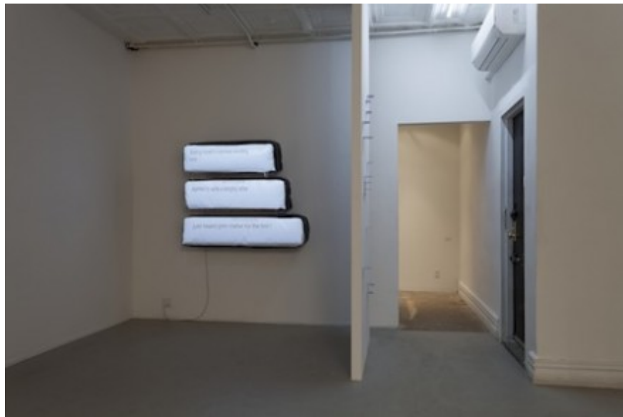
Anicka Yi, Divorce (Installation View)