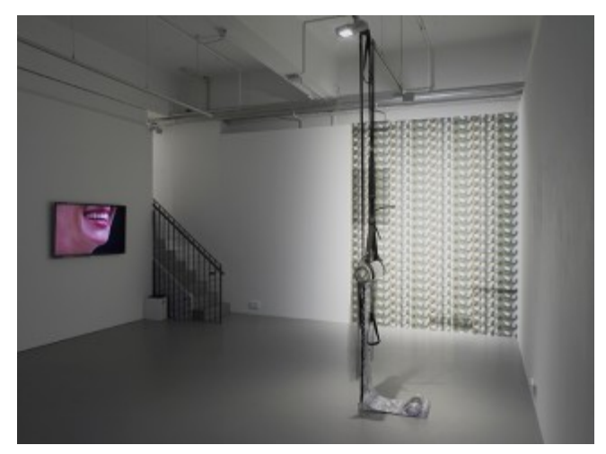
View of "Phantom Limbs," Pilar Corrias, London, 2014.

People who have lost arms or legs often report experiencing a "phantom limb"—the sense that the limb is still there, or that they can still move or feel it. It's a good metaphor, too, for current post-internet art debates concerning the shifting relationship of real to virtual, digital to material. "Phantom Limbs," Pilar Corrias's smarter-thanmost summer show, does a concise job of mapping the various poles of this cultural and theoretical inquiry. By assembling works that, broadly speaking, figure the human body as something caught in a world of networked relationships with images, technology, and other matter, the exhibition suggests that human subjectivity has invarious ways been displaced or reconfigured—or maybe still implicated and entangled in the world, but no longer representing the Cartesian subject of an older, "anthropocentric" worldview.