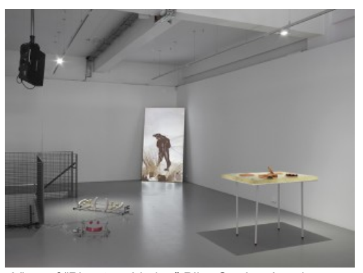
View of "Phantom Limbs," Pilar Corrias, London, 2014.

In this exhibition, phantom limbs signal a failure of the distinction between subject and object, or maybe the loss of priority between them. And if you wanted to force the core question at stake in the kind of post-internet art presented here, it could be that human subjectivity is fast becoming the virtual, imaginary side of the equation. So in Cécile B. Evans's 3D video, The Brightness (2013), a dialogue between two women—one supposedly a phantom limb specialist (uncannily also called Cecile B. Evans, who the artist consulted in researching the piece)—quickly unravels from a close-up of the woman's sparkling white teeth to a delirious CGI sequence of Busby Berkeley-esque dancing molars. In the closing sequence, the two women speak, but again, voices and bodies are out of sync—there's no verifiably secure, speaking subject, only mouths full of teeth